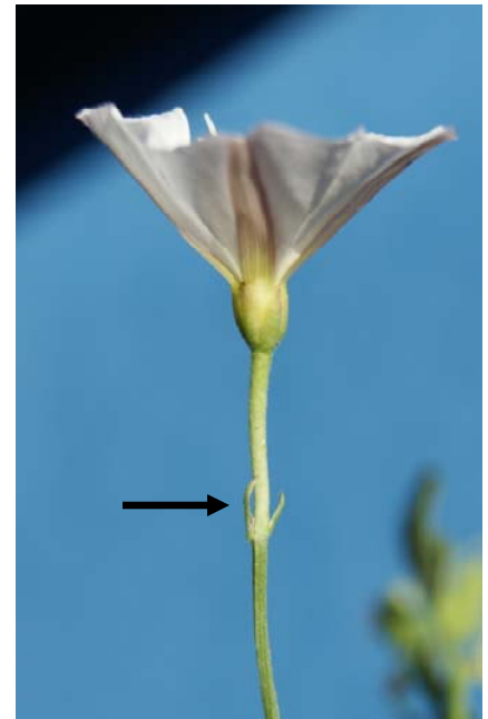
Small sepals on field bindweed